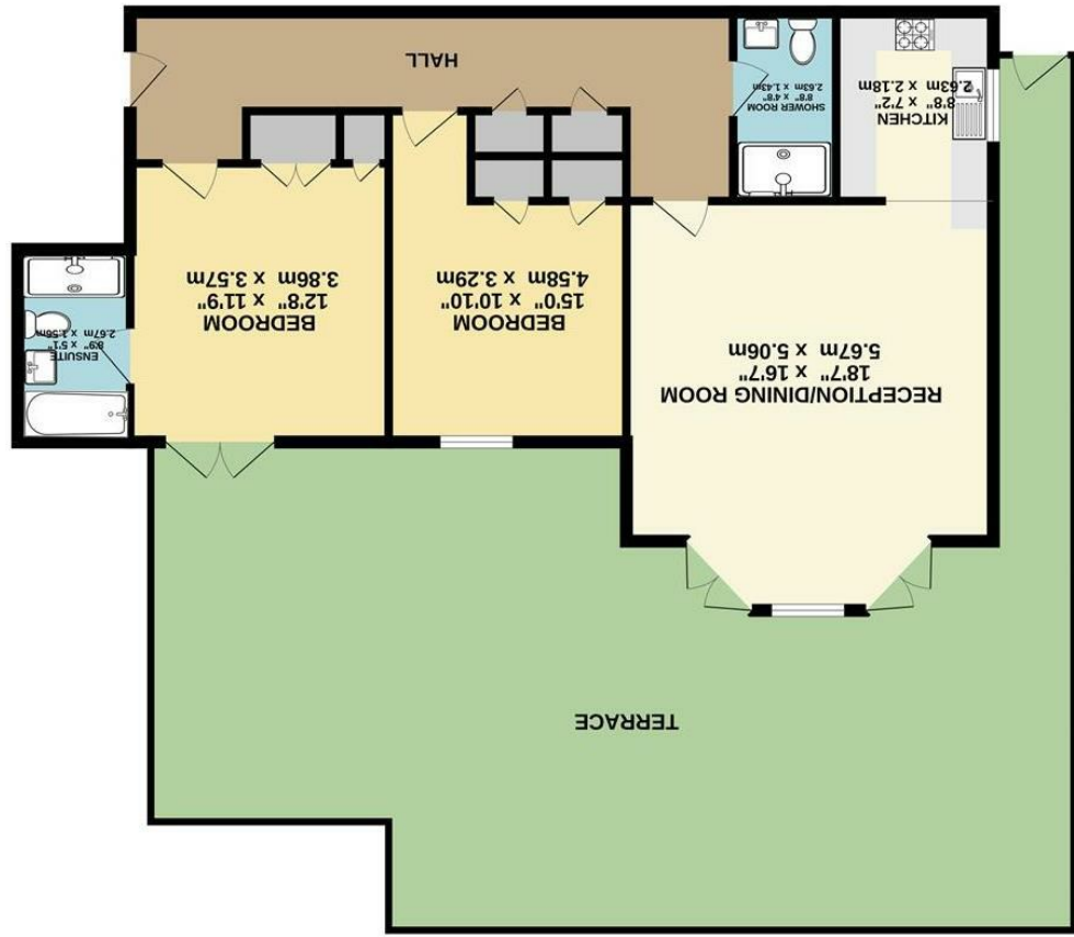
GROUND FLOOR (85.1 sq.m.) approx.