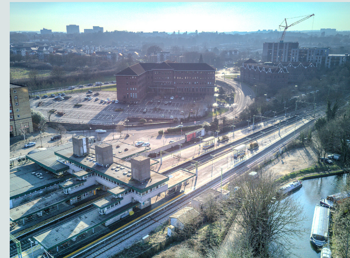
View of Field House adjacent to Harlow Town Station