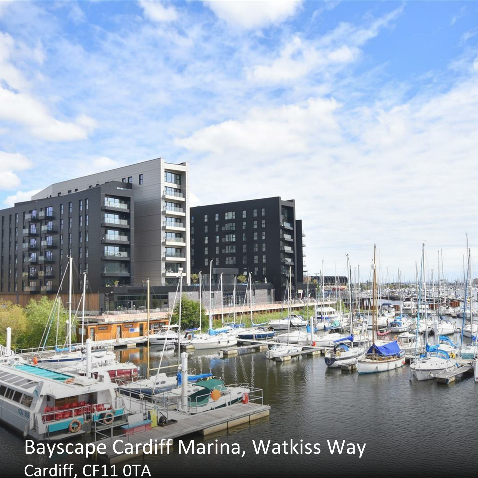
Bayscape Cardiff Marina, Watkiss Way Cardiff, CF11 0TA