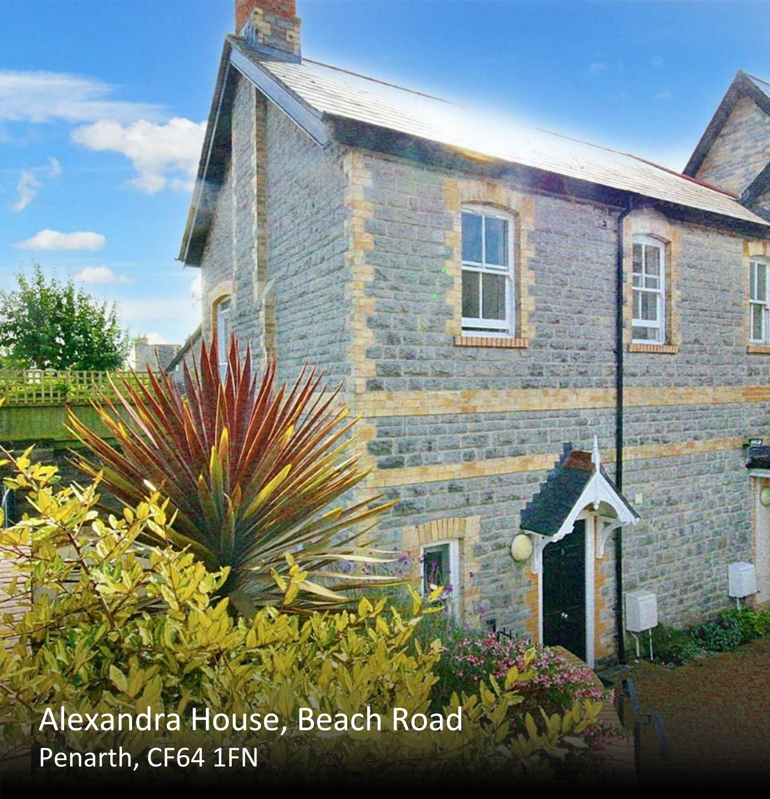
Alexandra House, Beach Road Penarth, CF64 1FN