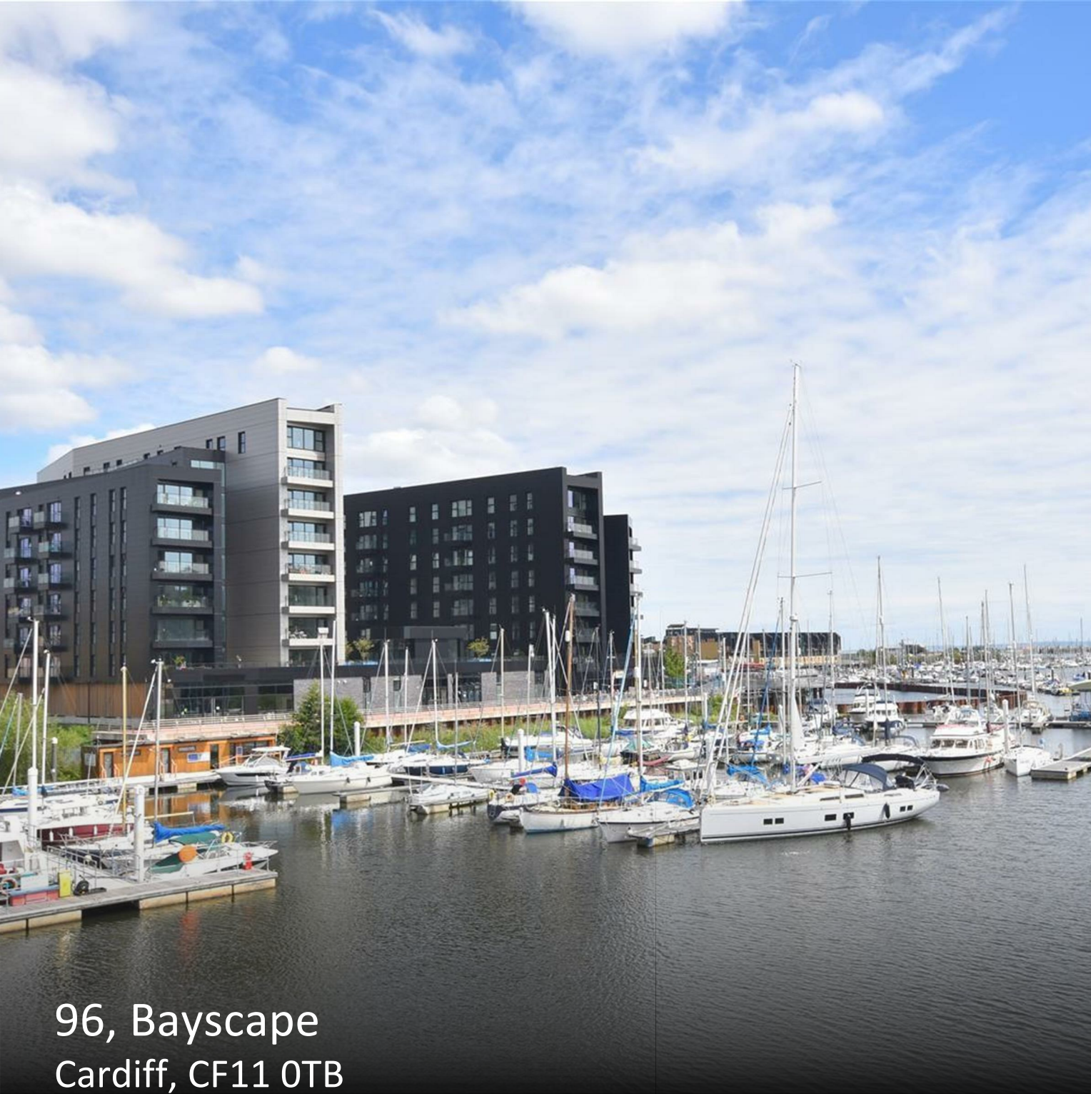
96, Bayscape Cardiff, CF11 0TB