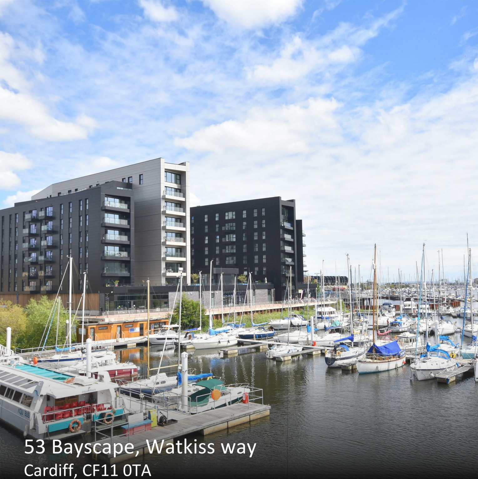
53 Bayscape, Watkiss way Cardiff, CF11 0TA