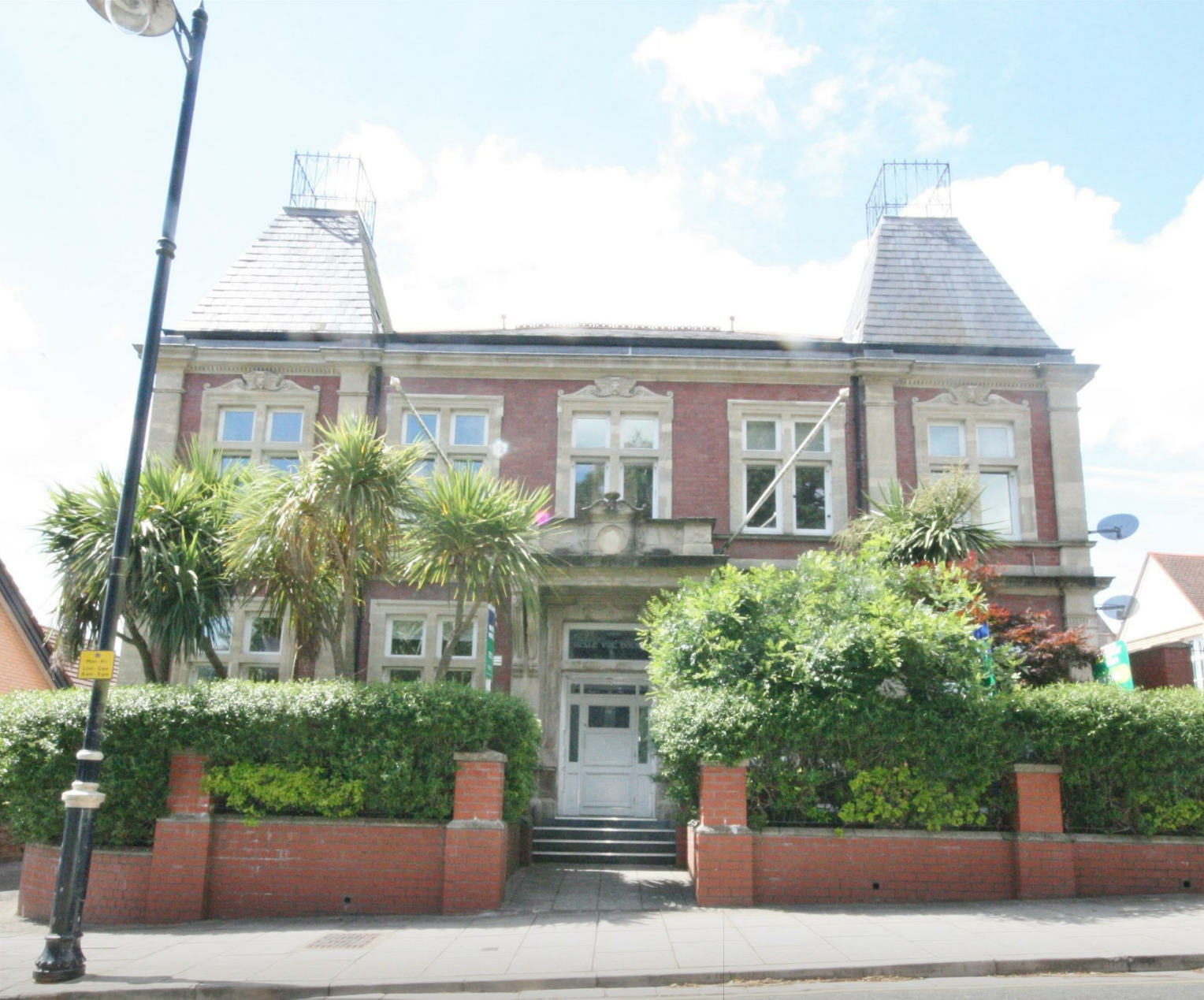
Belle Vue Court CF64 1BX