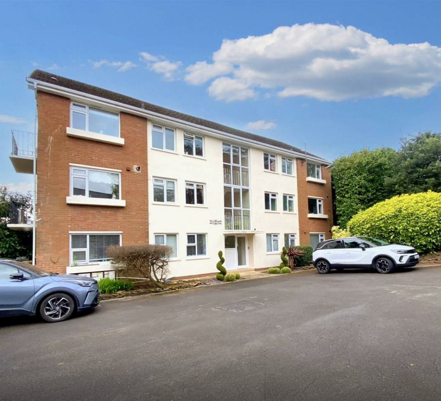
3 Ashford House, Brooklea Park Cardiff, CF14 0XD