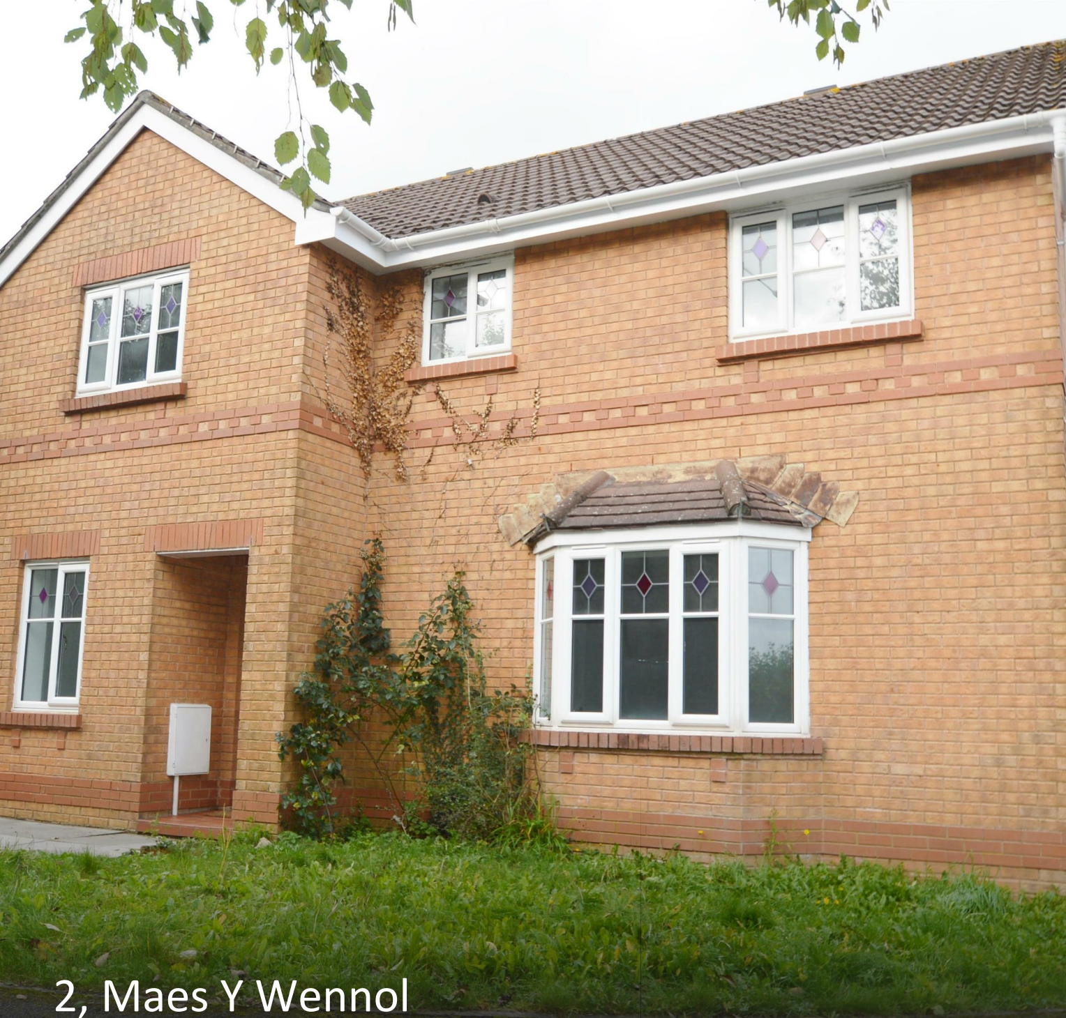
2, Maes Y Wennol Pontyclun, CF72 8SB