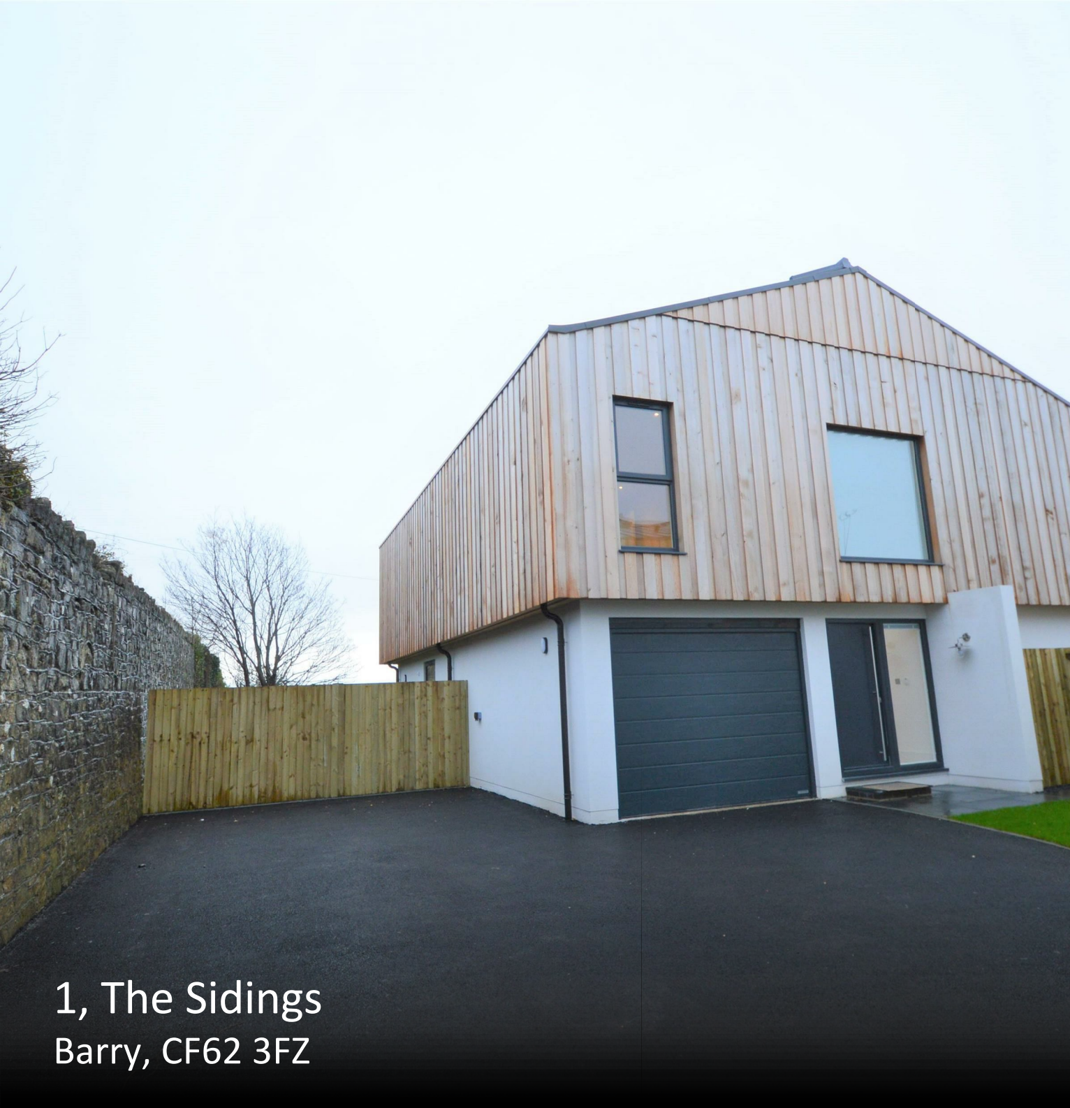
1, The Sidings Barry, CF62 3FZ