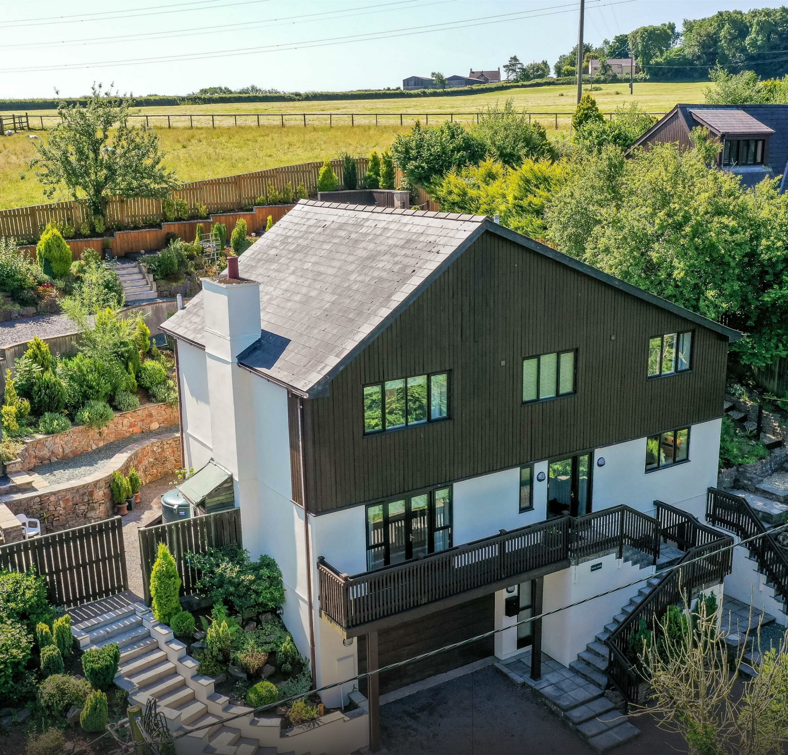
Near Cowbridge, CF71 7RT