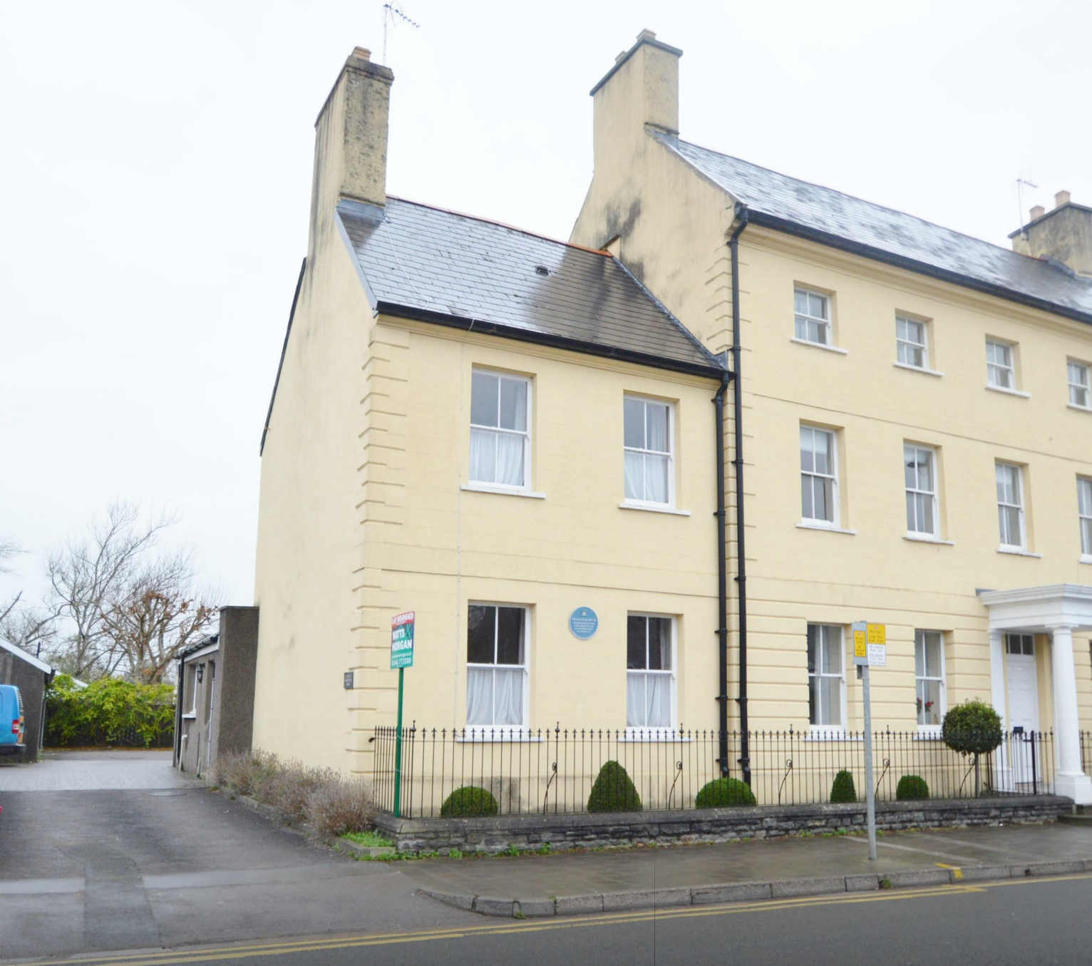
Flat 4 Woodstock House, High Street Cowbridge, CF71 7AF