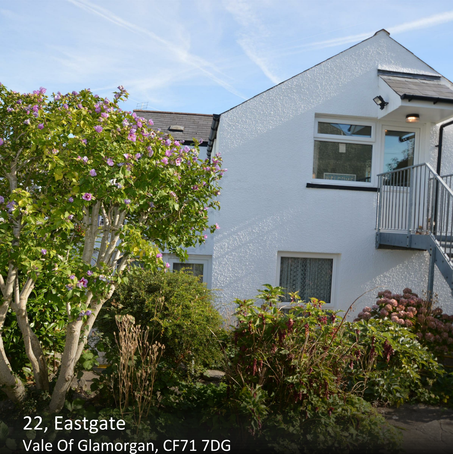
22, Eastgate Vale Of Glamorgan, CF71 7DG