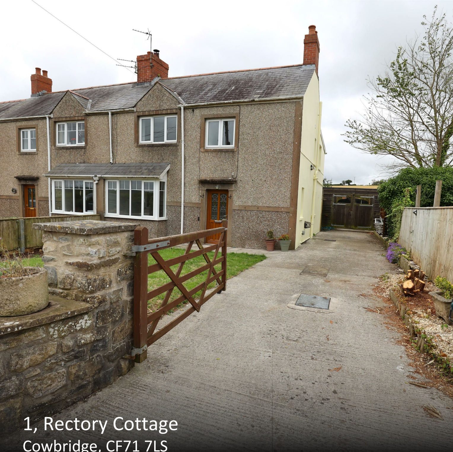
1, Rectory Cottage Cowbridge, CF71 7LS