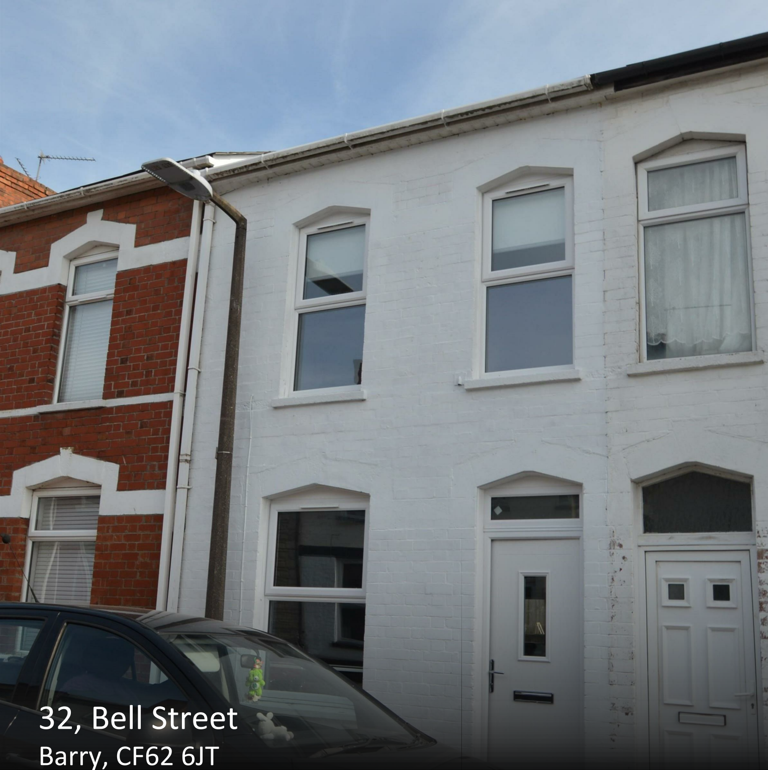
32, Bell Street Barry, CF62 6JT