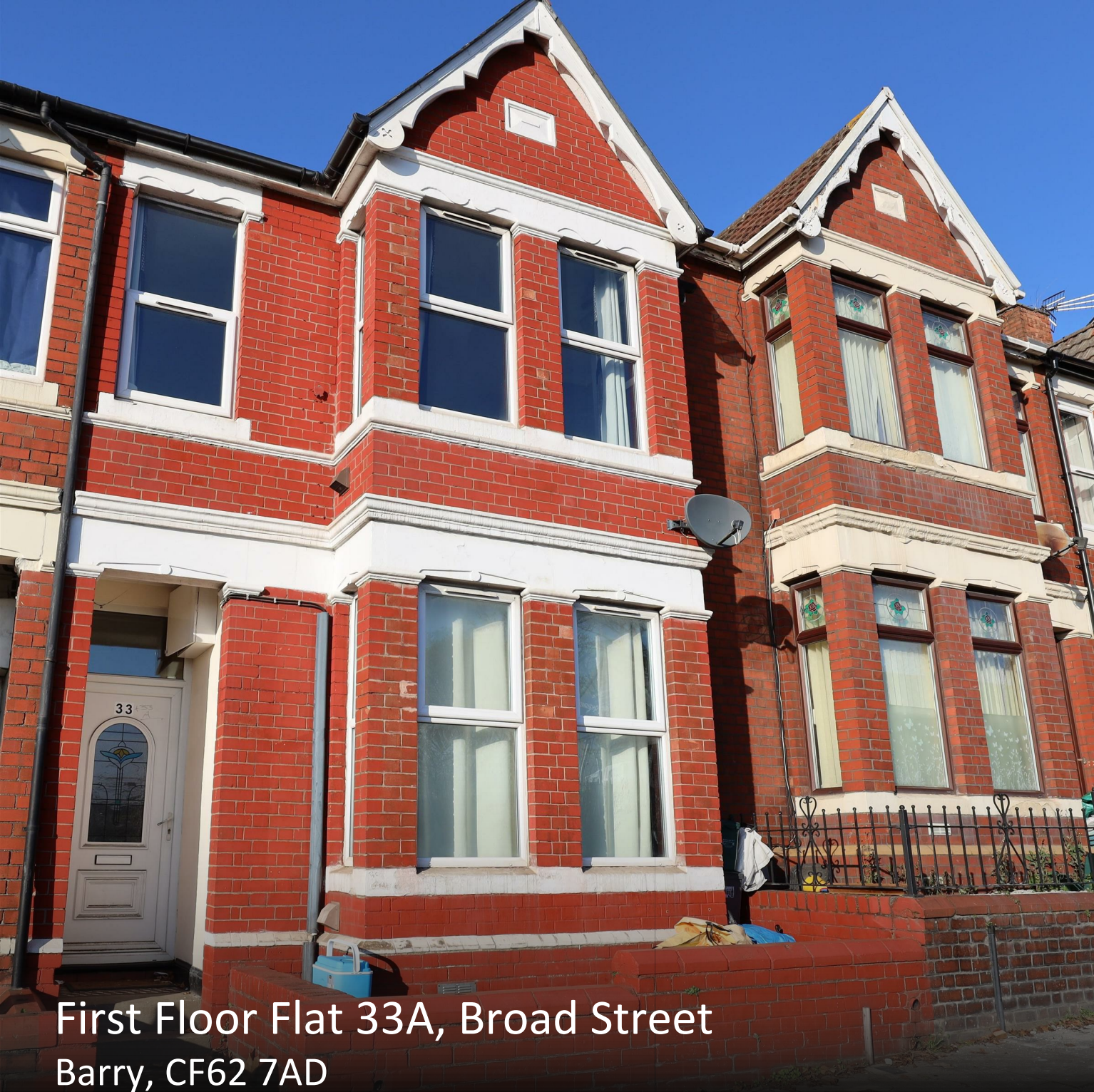
First Floor Flat 33A, Broad Street Barry, CF62 7AD