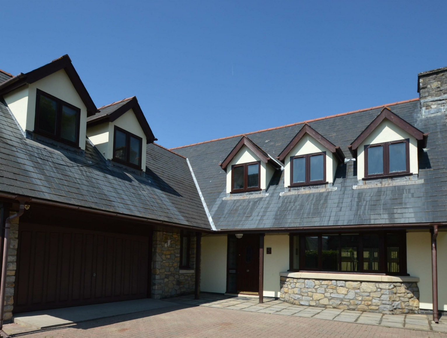
5, Great House Meadows Vale Of Glamorgan, CF61 1SU