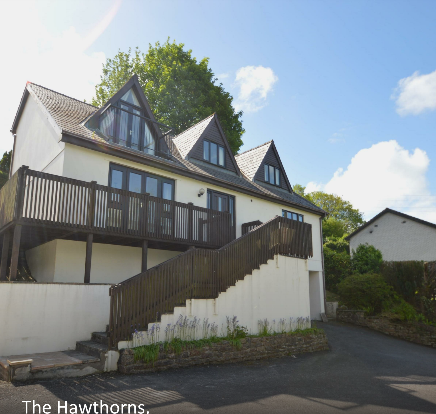
The Hawthorns, Cowbridge, CF71 7RT