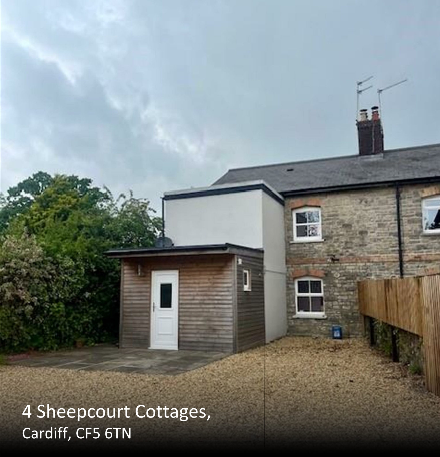
4 Sheepcourt Cottages, Cardiff, CF5 6TN