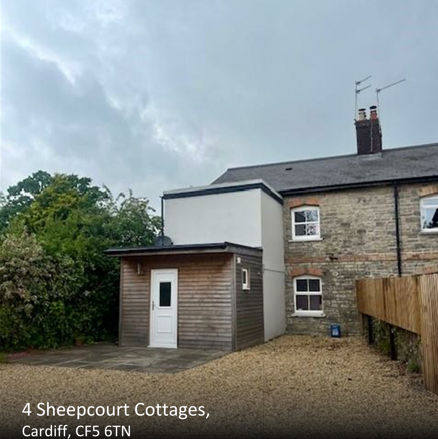
4 Sheepcourt Cottages, Cardiff, CF5 6TN