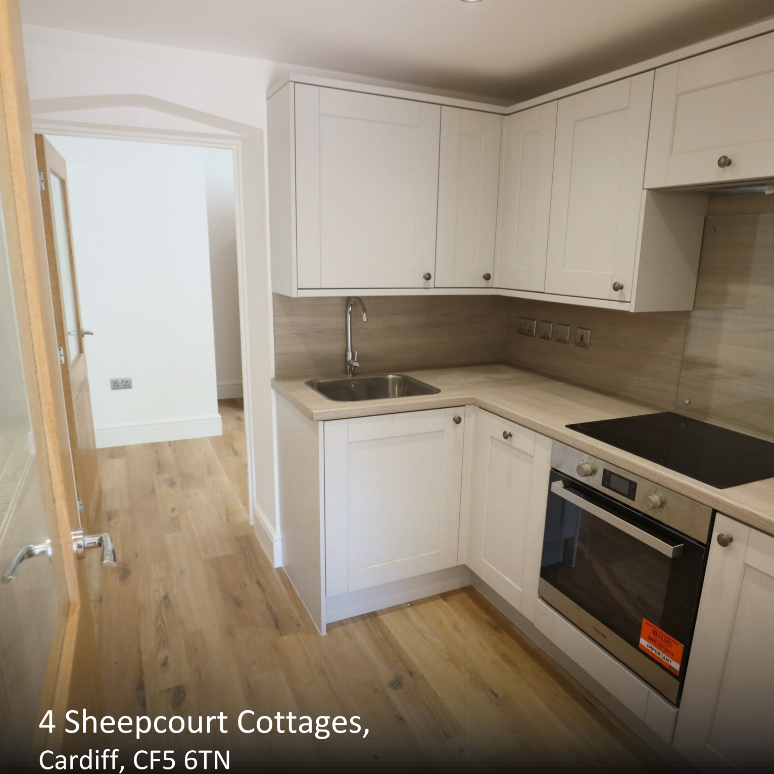
4 Sheepcourt Cottages, Cardiff, CF5 6TN