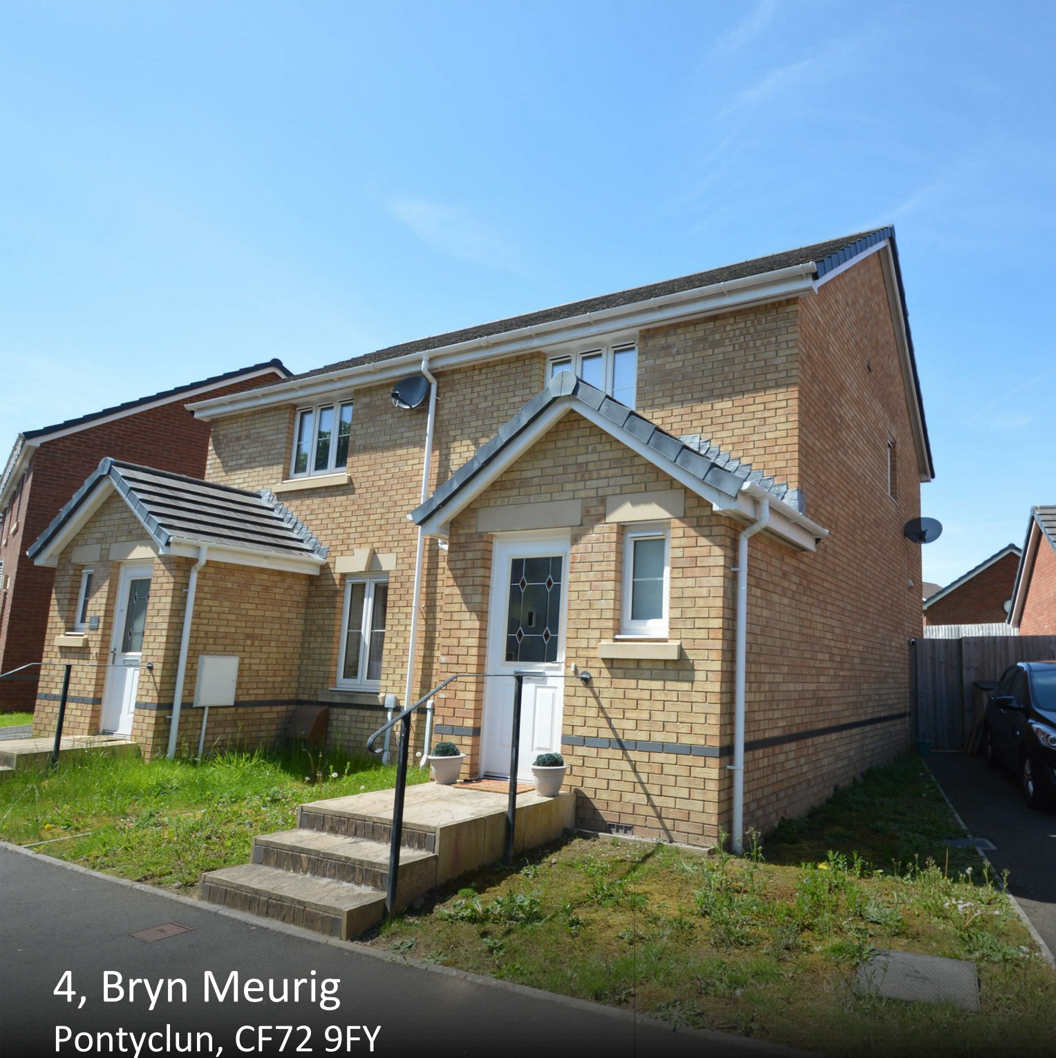
4, Bryn Meurig Pontyclun, CF72 9FY