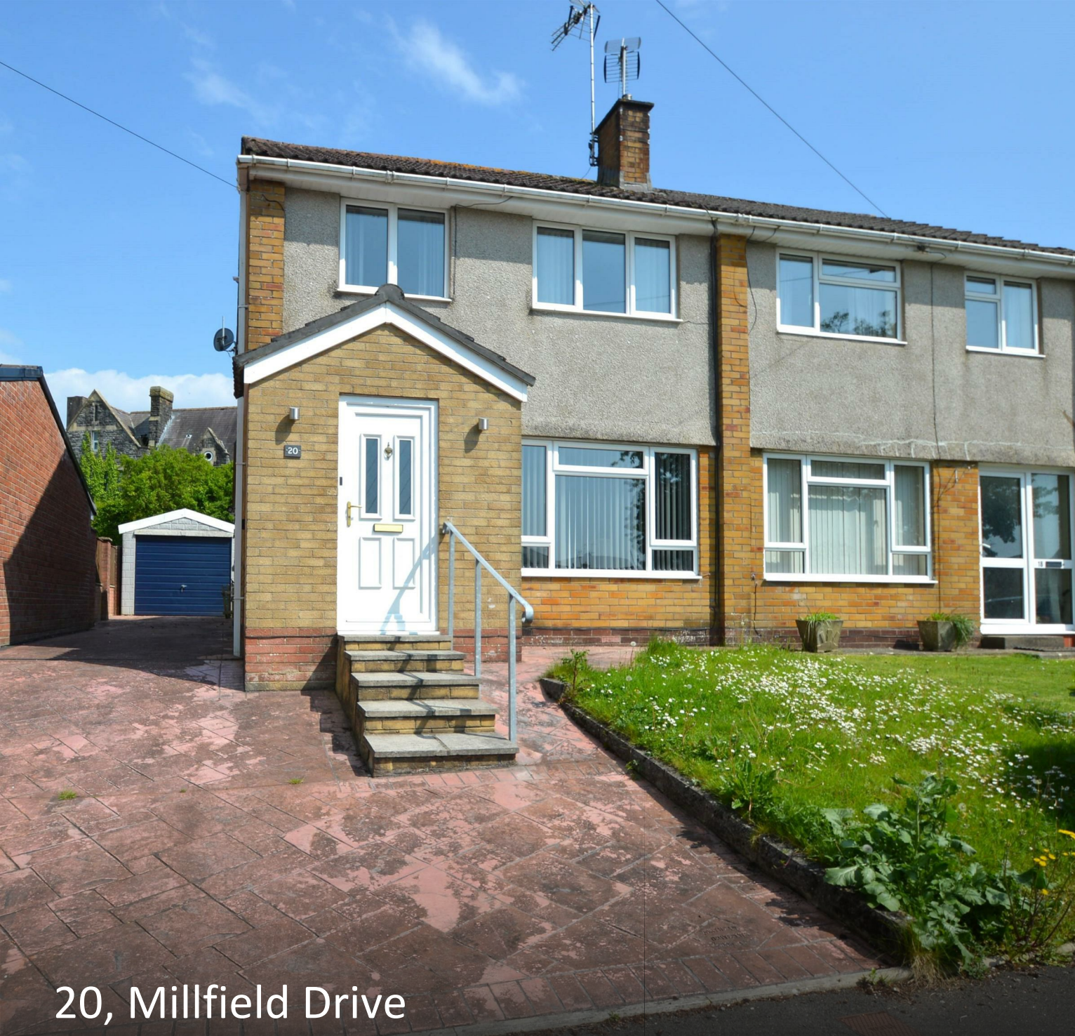
20, Millfield Drive Cowbridge, CF71 7BR