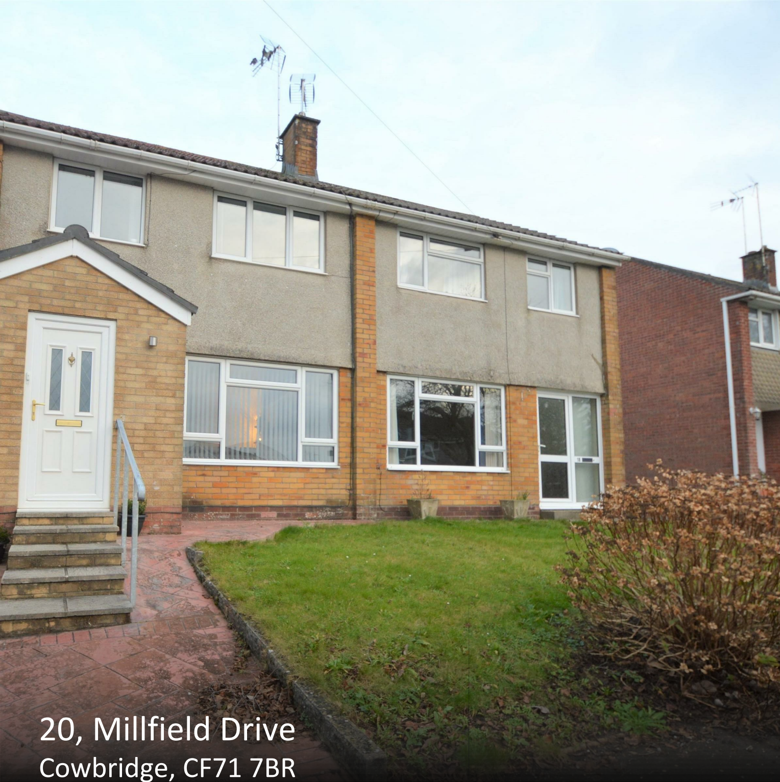
20, Millfield Drive Cowbridge, CF71 7BR