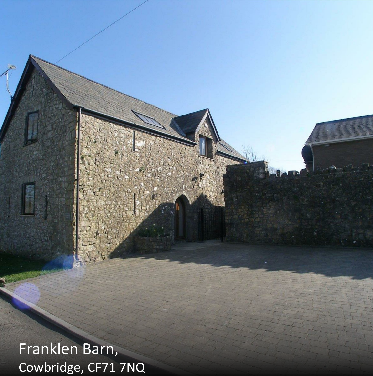
Franklen Barn, Cowbridge, CF71 7NQ