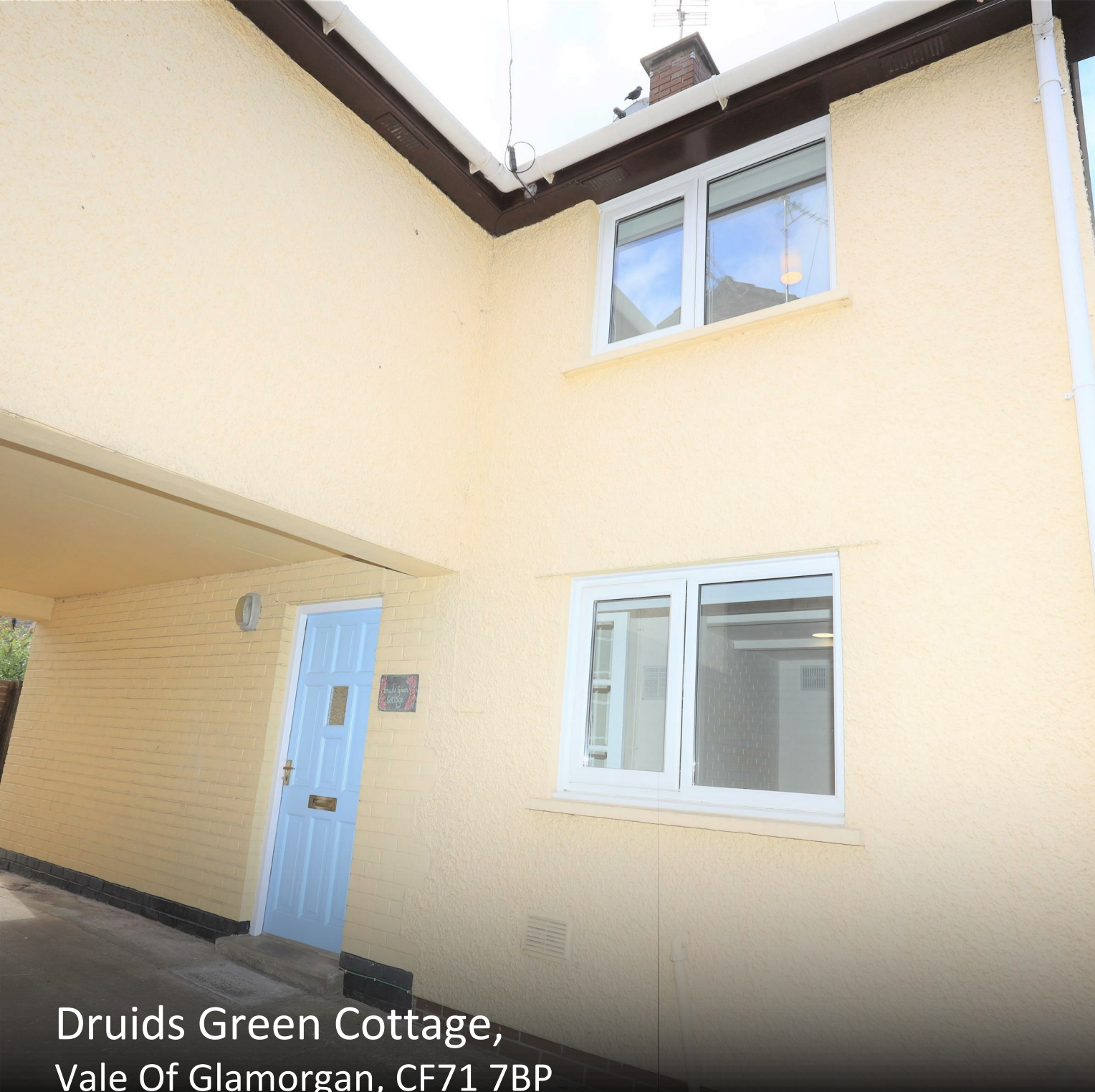
Druids Green Cottage, Vale Of Glamorgan, CF71 7BP