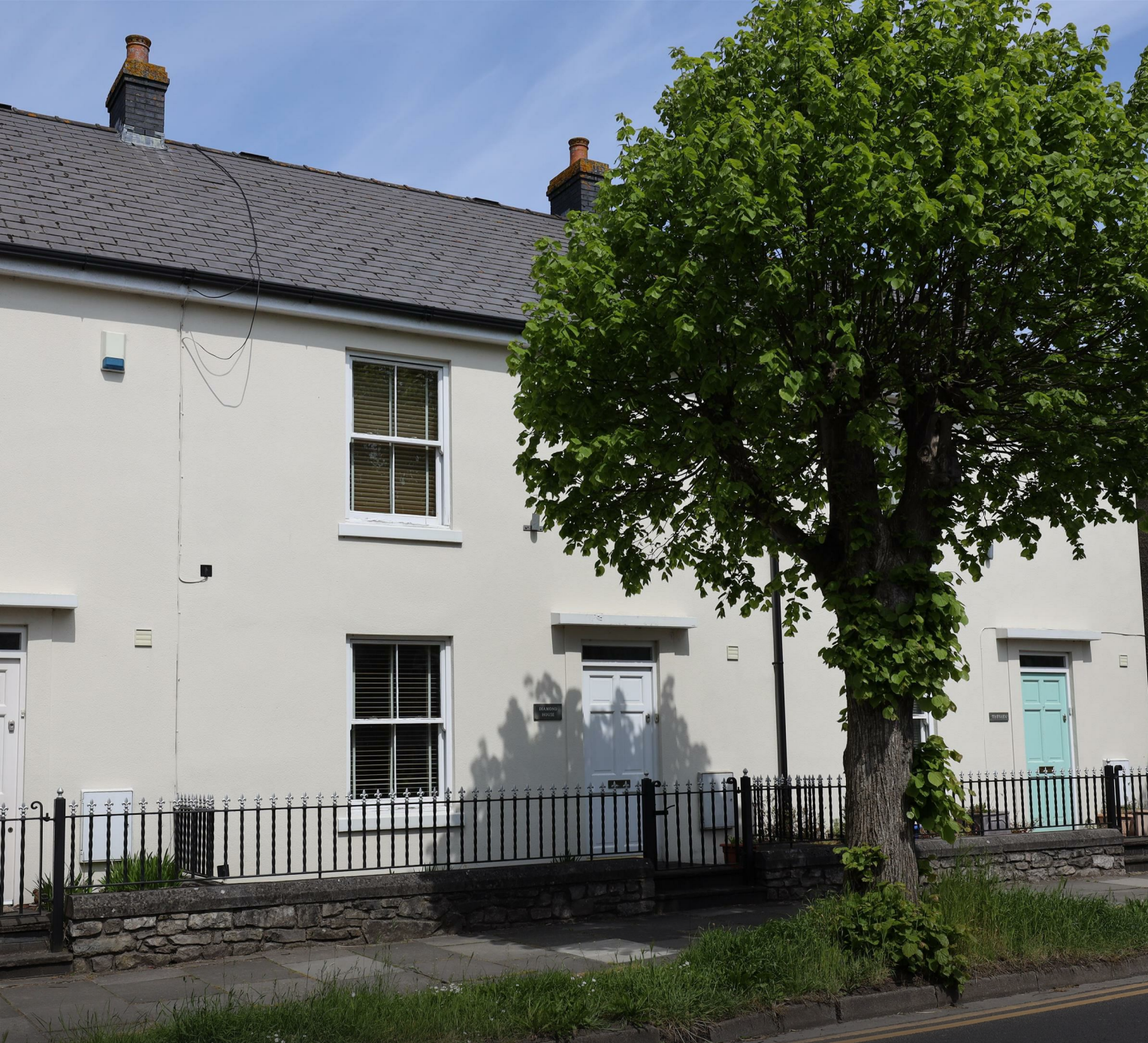
Diamond House, Westgate Cowbridge, CF71 7AQ