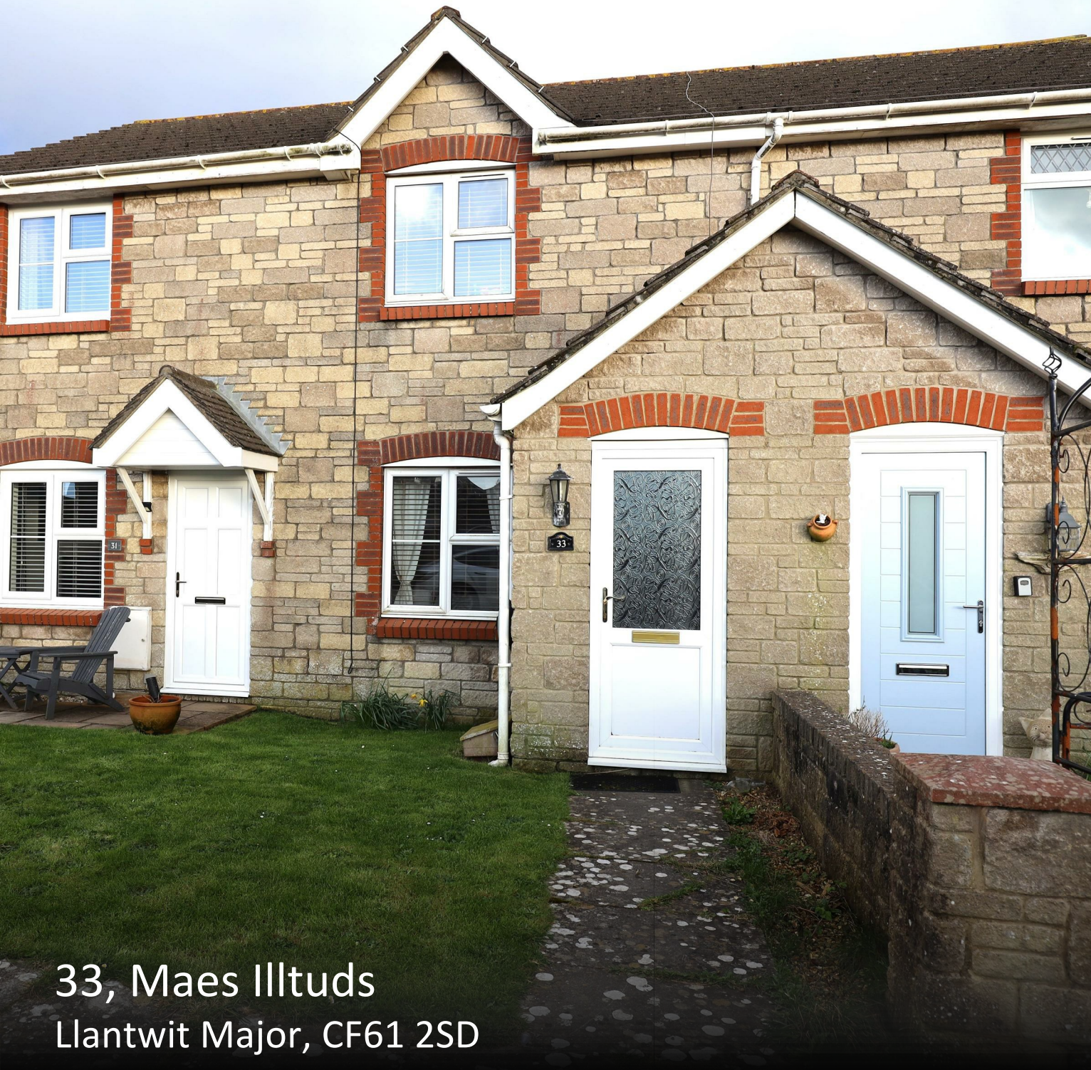
33, Maes Illtuds Llantwit Major, CF61 2SD