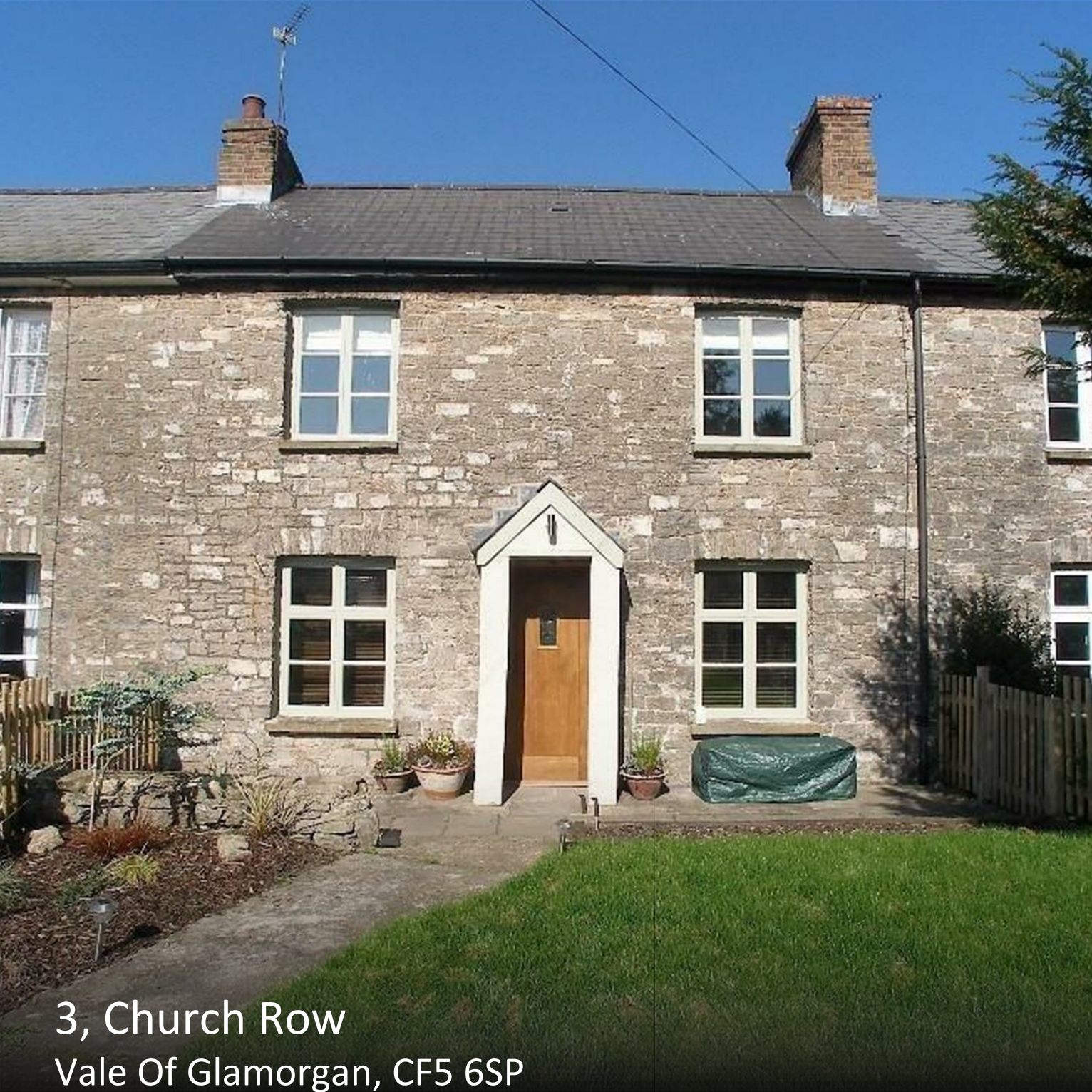
3, Church Row Vale Of Glamorgan, CF5 6SP