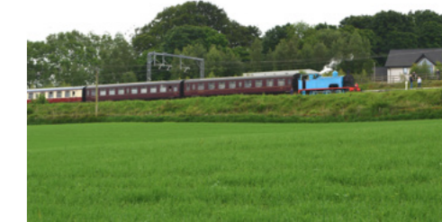
Myrehead Farmhouse Linlithgow, EH49 6LQ