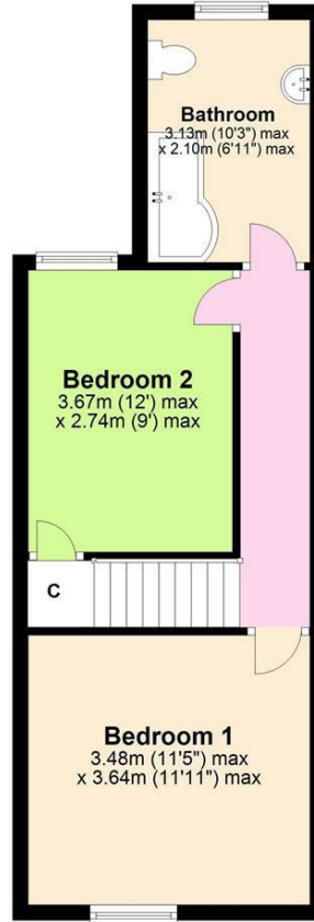
Total area: approx. 73.2 sq. metres (788.4 sq. feet)