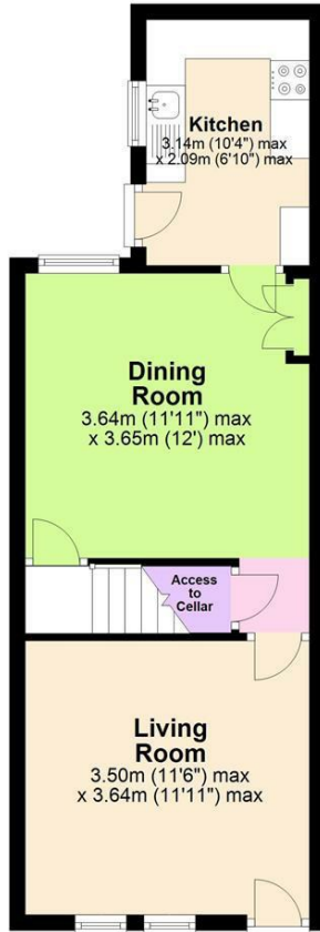
Ground Floor Approx. 36.6 sq. metres (394.3 sq. feet)