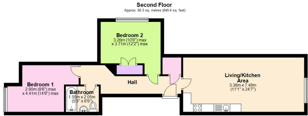
Total area: approx. 60.3 sq. metres (649.4 sq. feet)