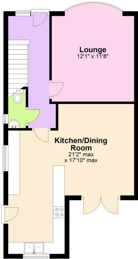
Ground Floor Approx. 521.2 sq. feet