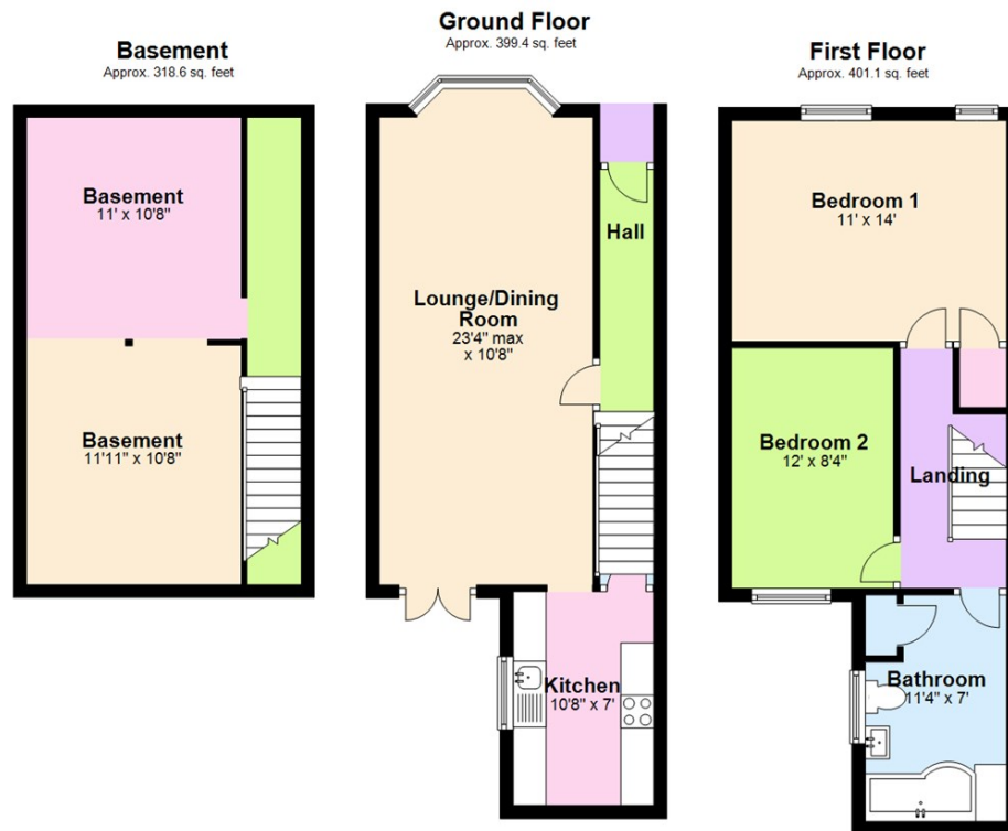
Total area: approx. 1119.0 sq. feet