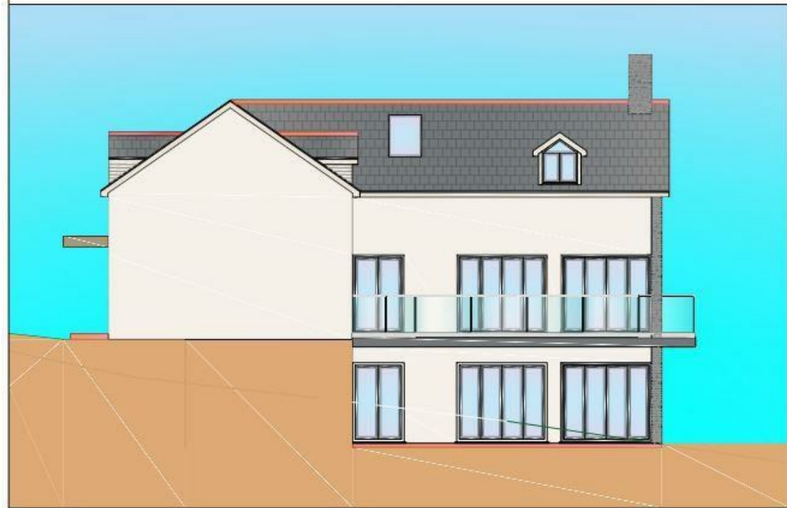
PLOTS 1 & 2 PROPOSED SIDE ELEVATION EAST