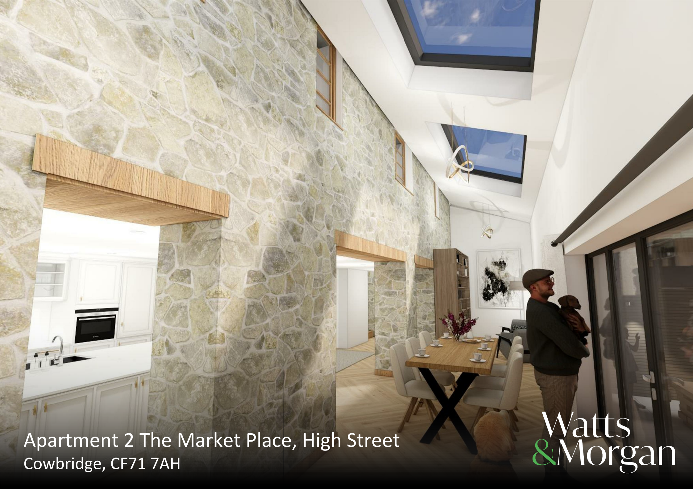
Apartment 2 The Market Place, High Street Cowbridge, CF71 7AH