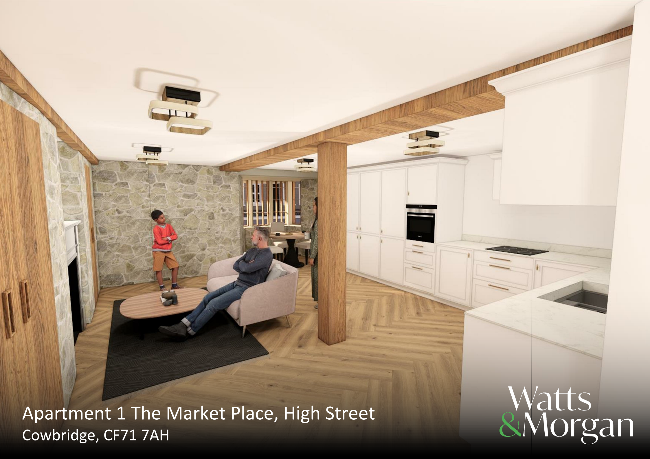
Apartment 1 The Market Place, High Street Cowbridge, CF71 7AH