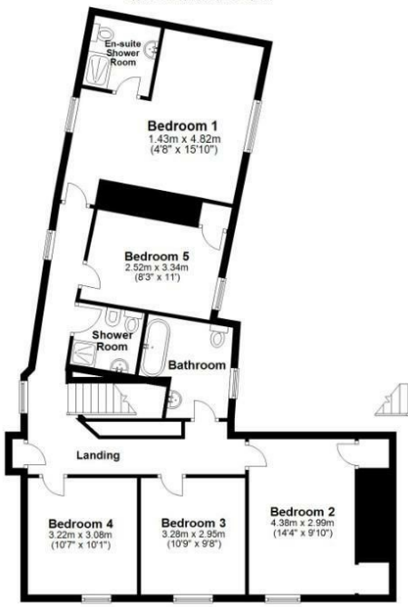
First Floor Approx. 101.6 sq. metres (1093.7 sq. feet)