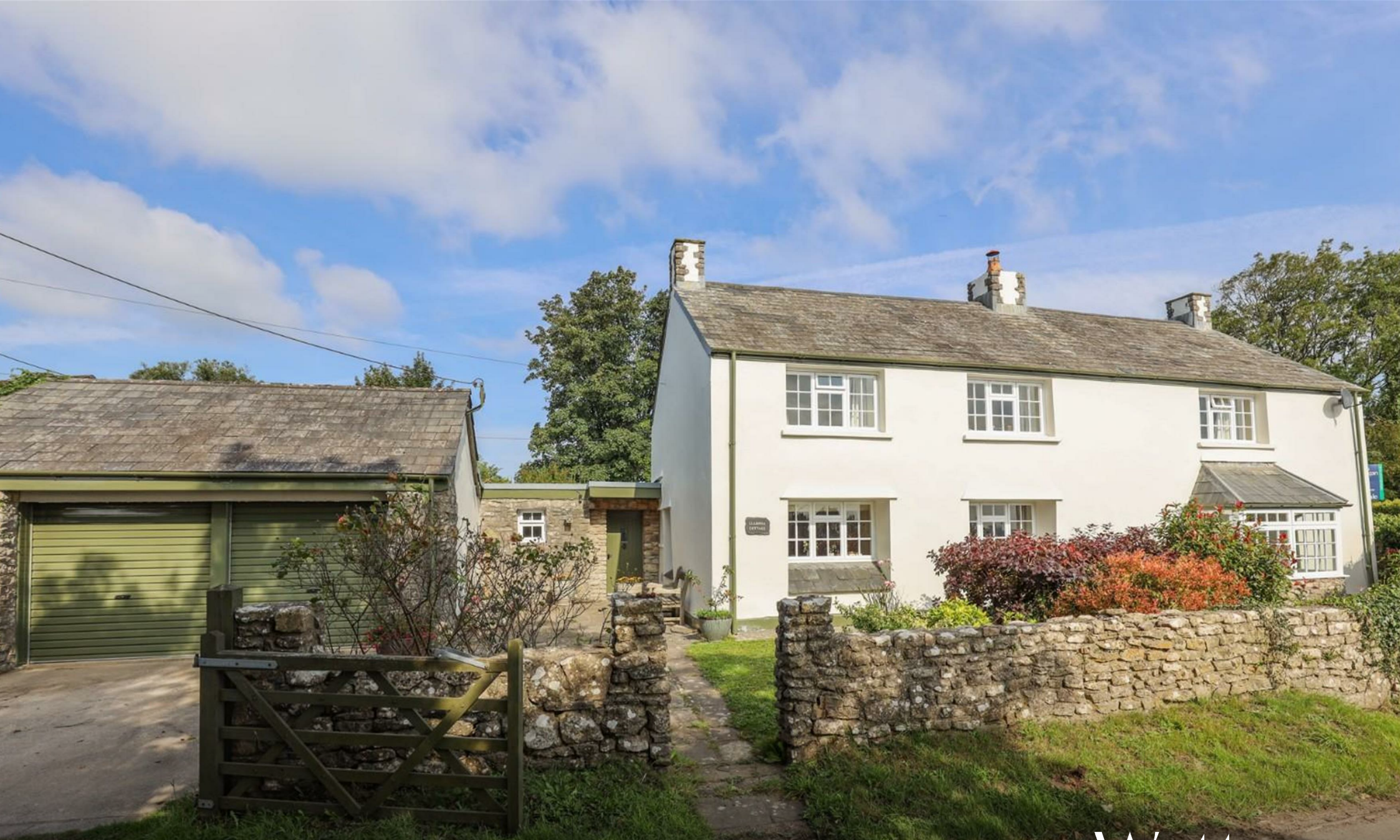
Llampha Cottage Llampha, Vale of Glamorgan, Nr Ewenny, CF35 5AF