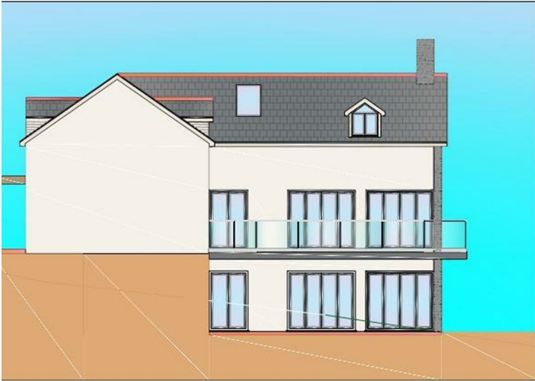
1 & 2 EAST SIDE ELEVATION