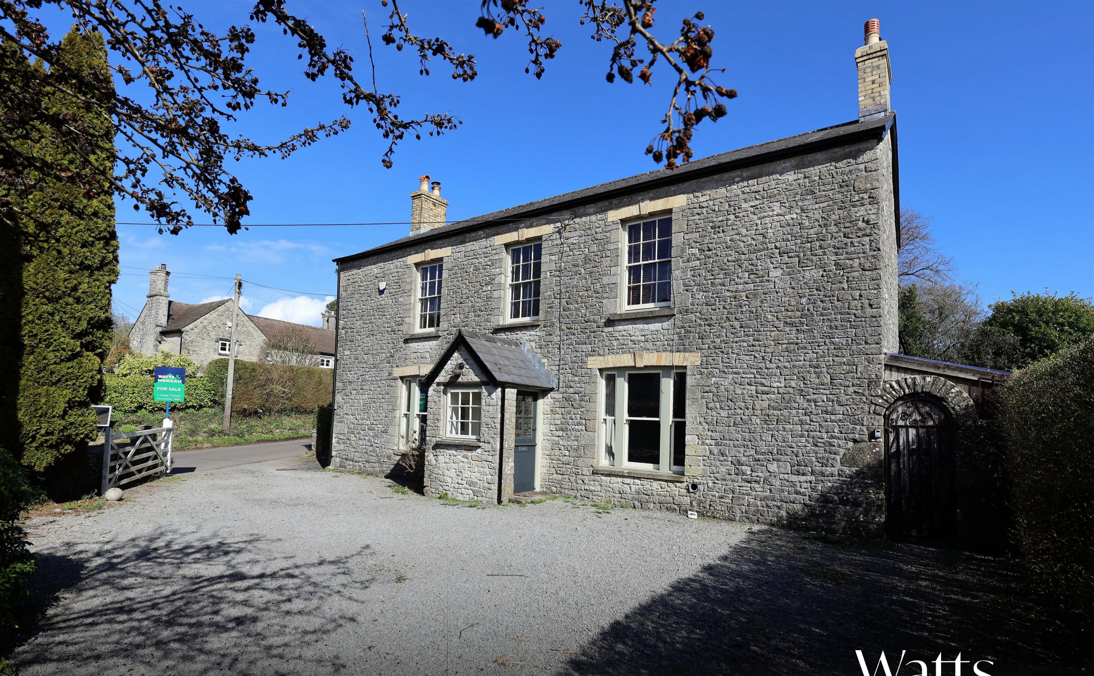
West House, Cowbridge, Vale Of Glamorgan, CF71 7DP