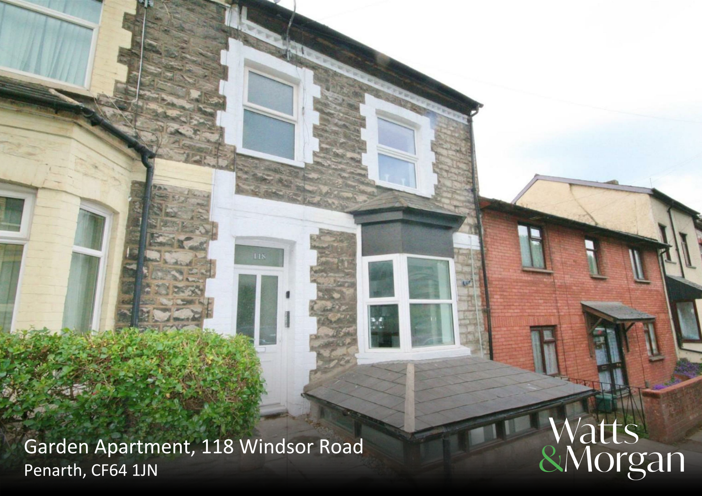
Garden Apartment, 118 Windsor Road Penarth, CF64 1JN