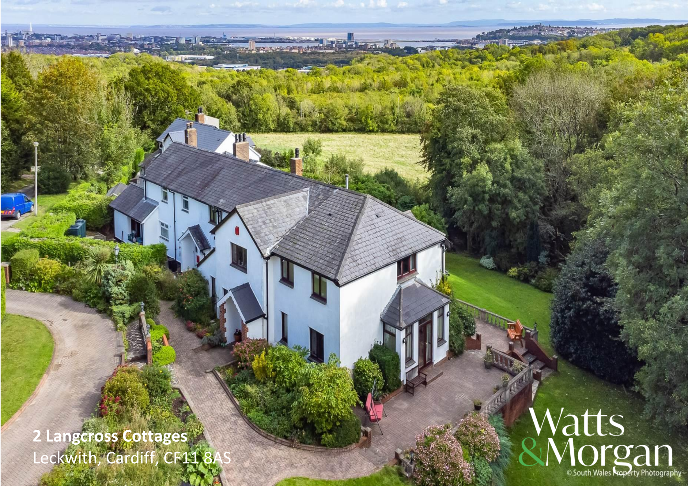
2 Langcross Cottages Leckwith, Cardiff, CF11 8AS