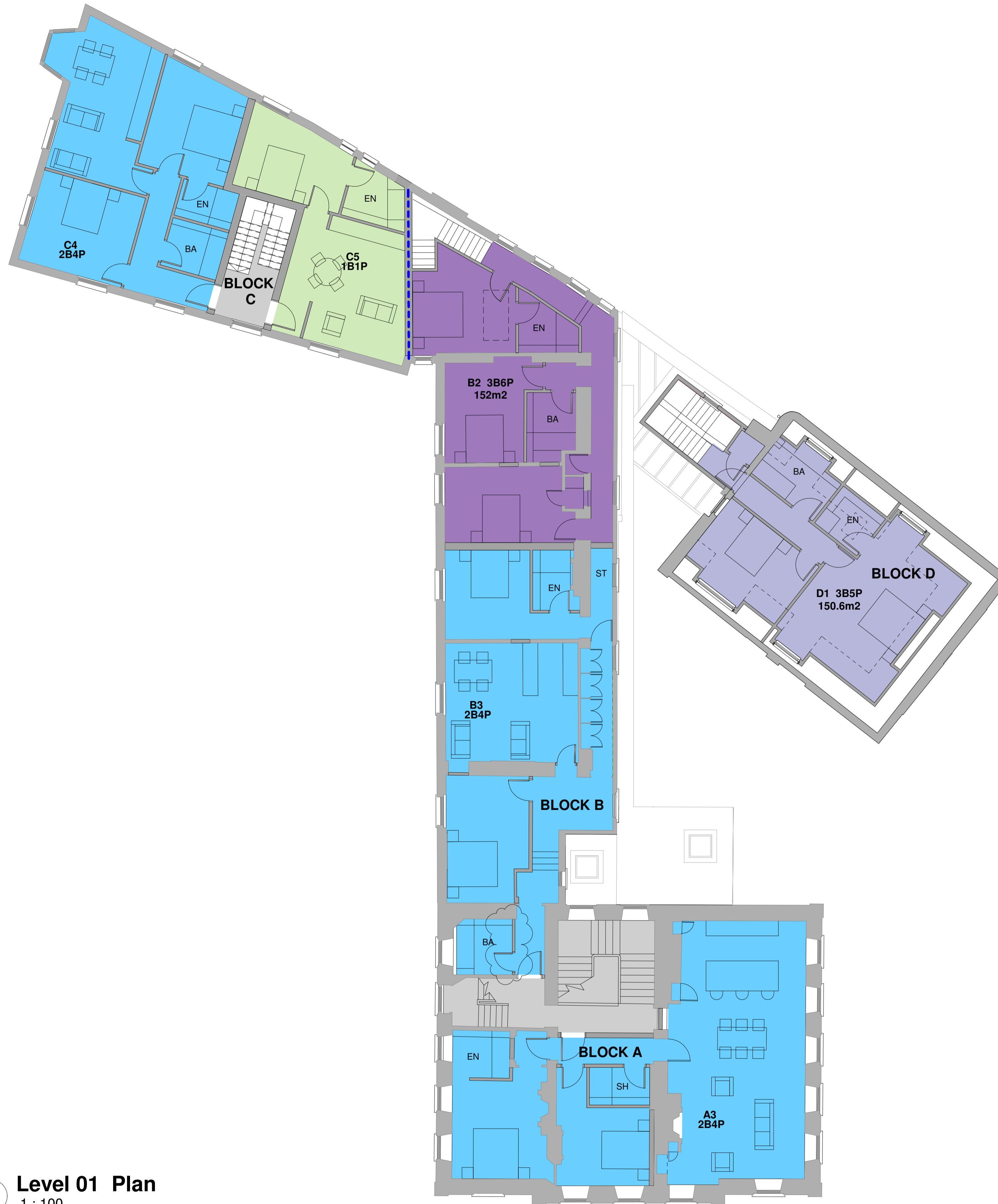
1 Level 01 Plan 1:100