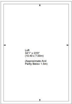
Loft (72.80 sq m)

For illustration purposes only. Not to scale. All measurements are taken and shown at floor level.