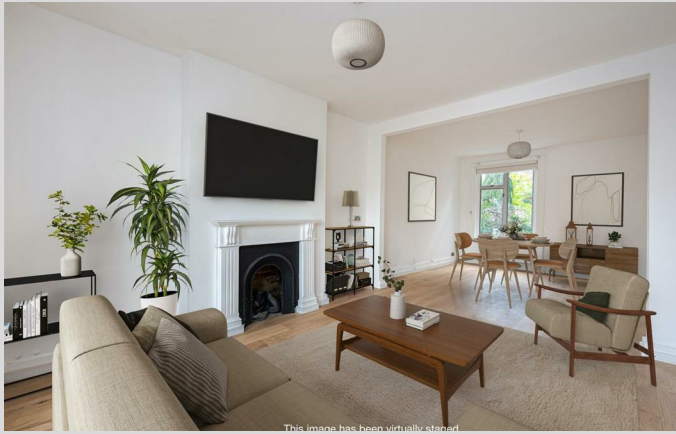
This image has been virtually staged