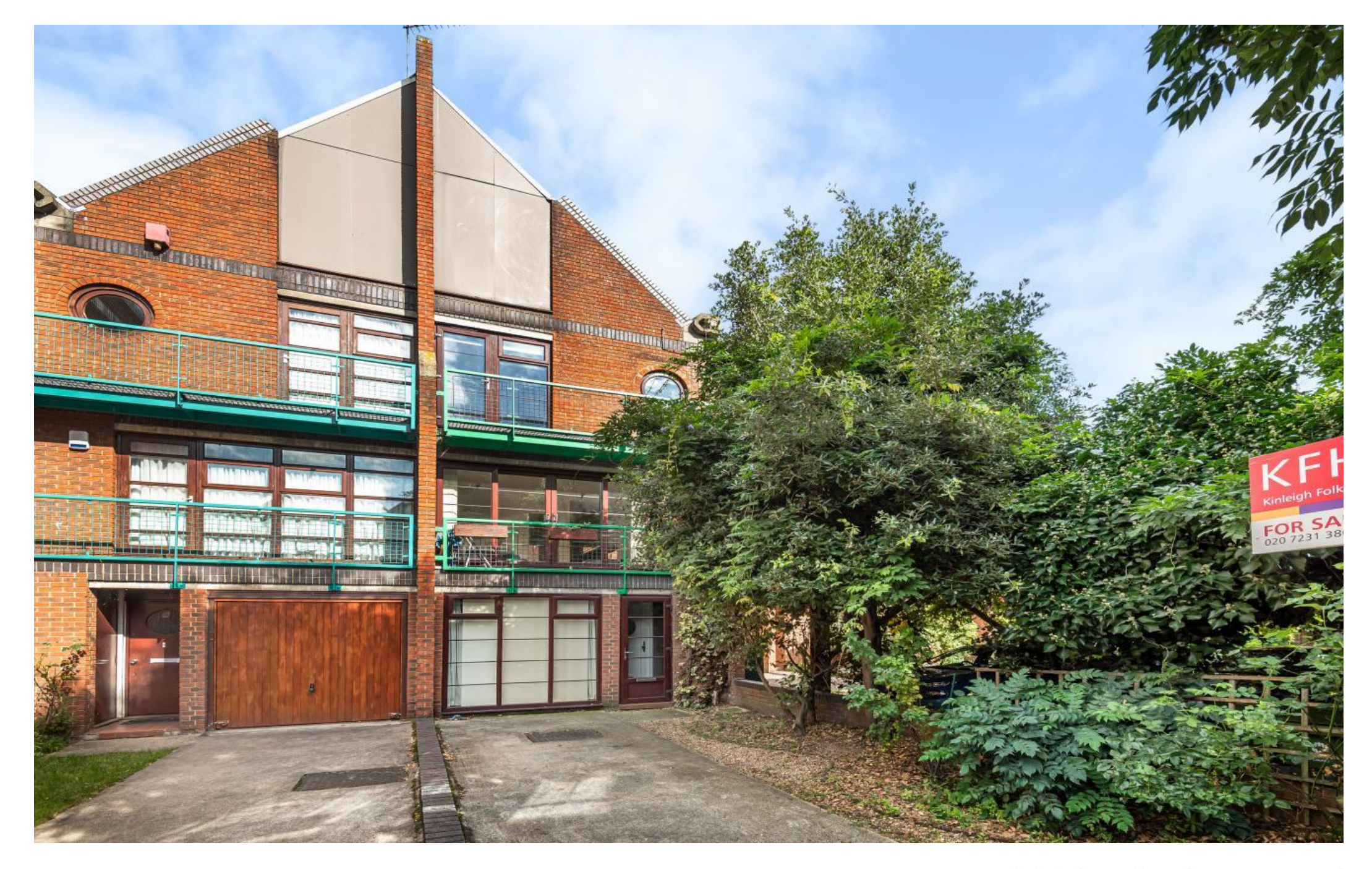
Elephant Lane, Rotherhithe, SE16