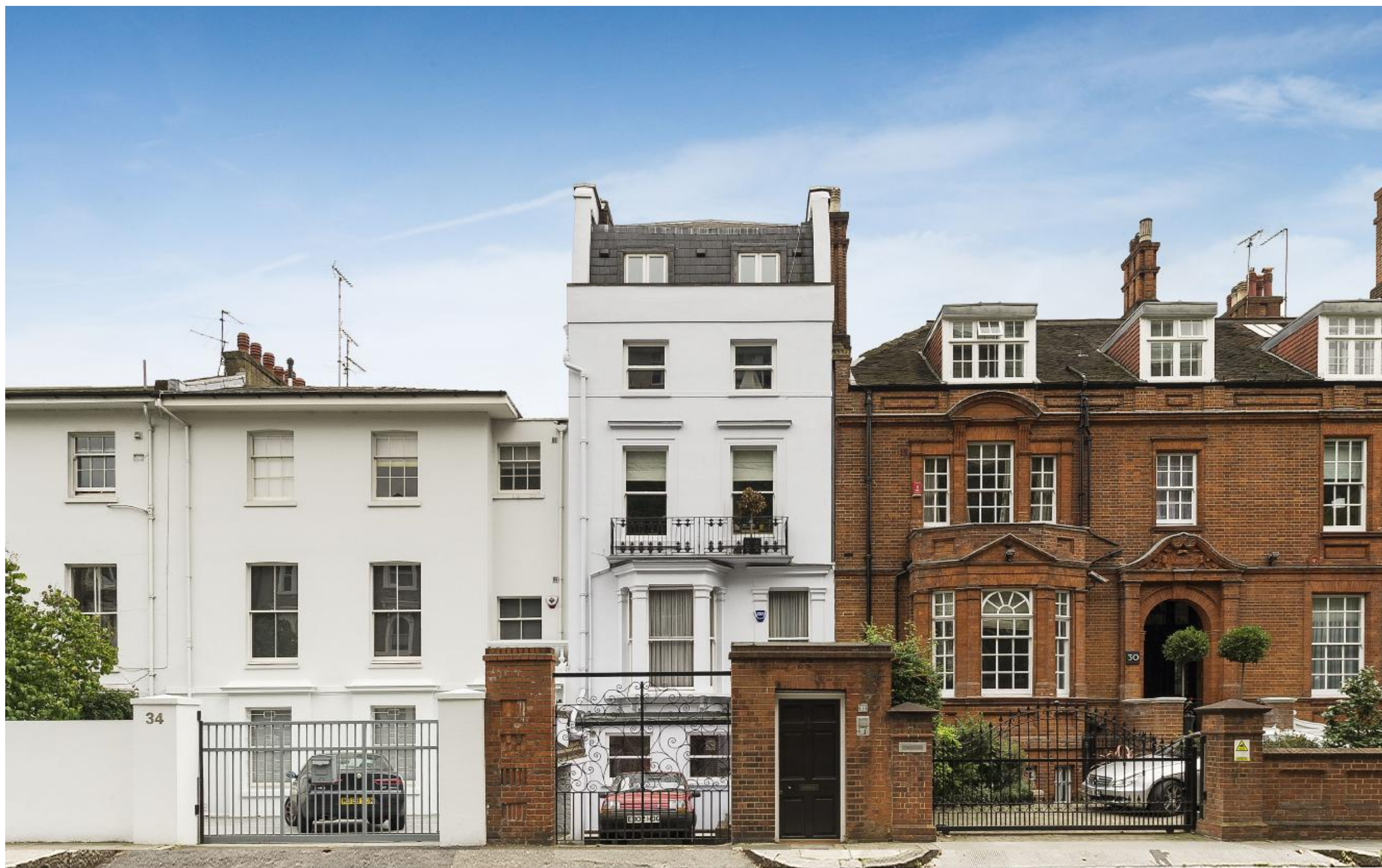
Abercorn Place, St Johns Wood, NW8