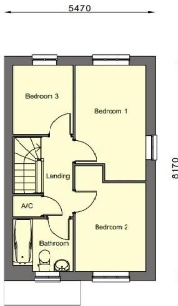
First Floor Plan - 1:50