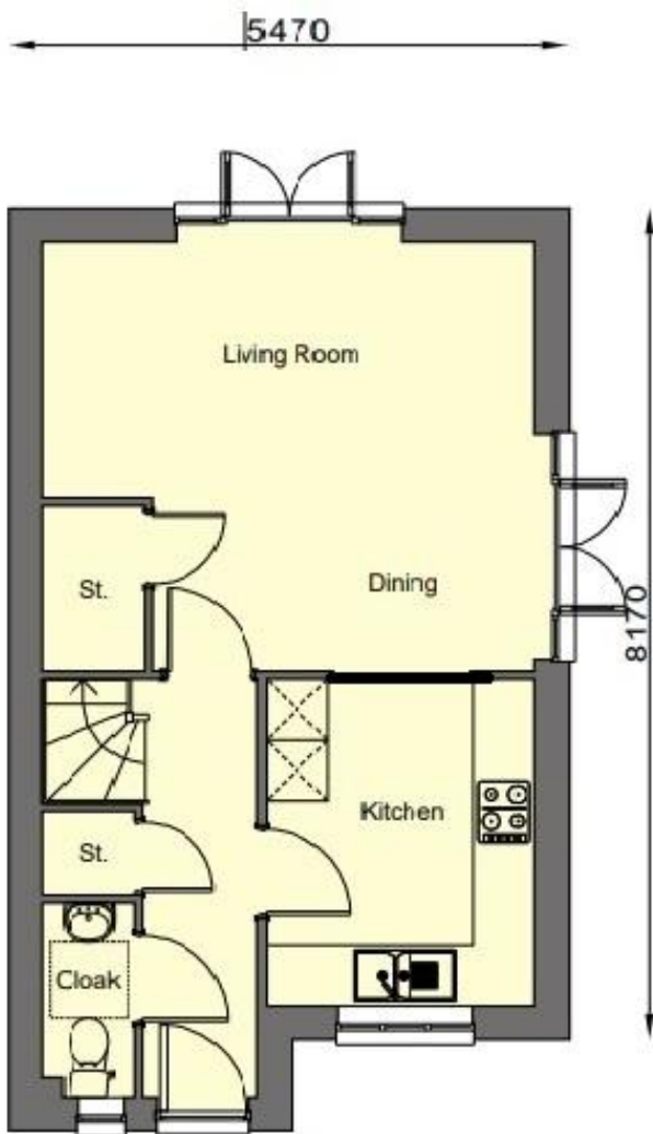
Ground Floor Plan - 1:50