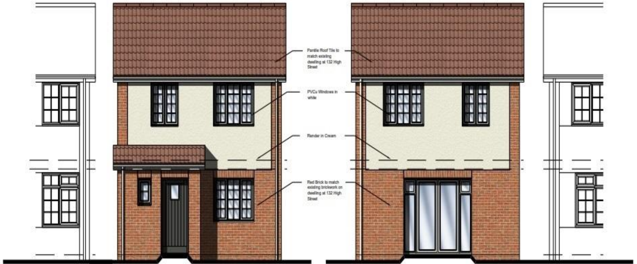
Front Elevation - 1:50 (North West)