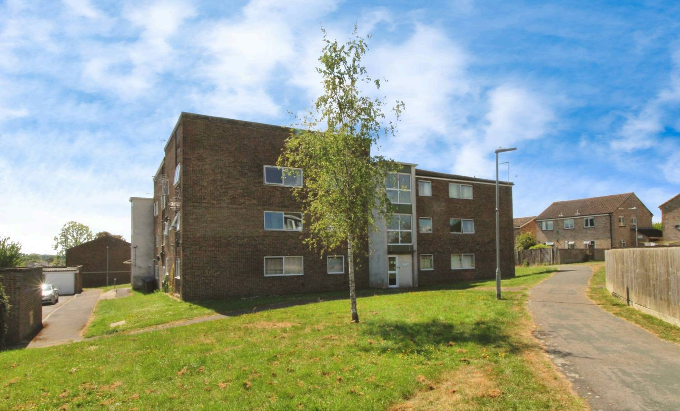
Parsonage Farm Close, Cricklade – SN6 6LX Swindon

Guide Price £175,000 mcfarlane property.com